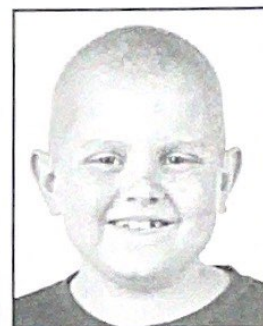
Aiden lymph system cancer

St Clare Of Assisi School 1911 Hone Ave. Bronx, NY 10461-1303